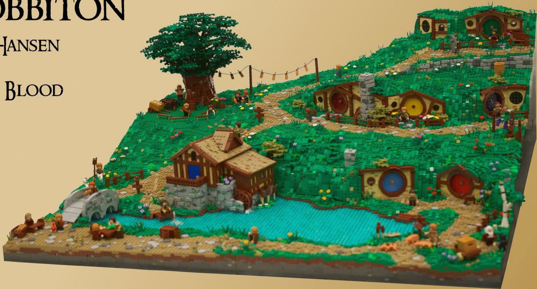
Reference Image: Hobbiton